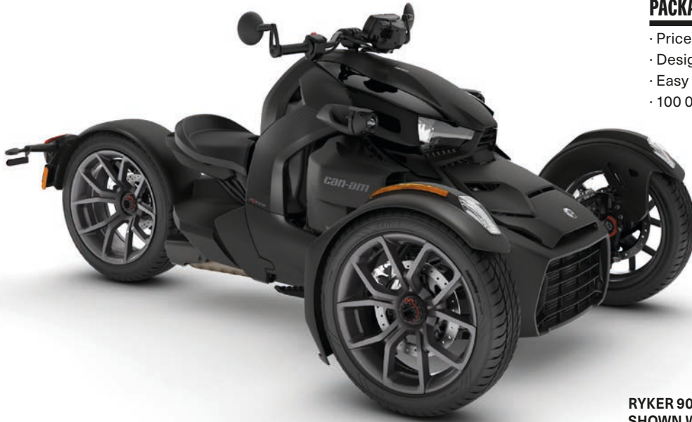
RYKER 900 SHOWN WITH INTENSE BLACK PANELS